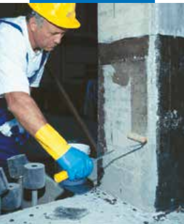
Applying a coat of MapeWrap Primer 1