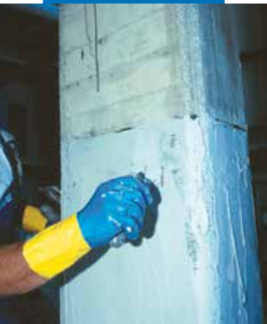
Levelling with MapeWrap 11 or MapeWrap 12