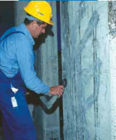
Preparing the substrate