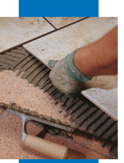
Single-fired tile on terrazzo tile of an external wall

Installation of single-fired tile on expanded foam concrete block walls