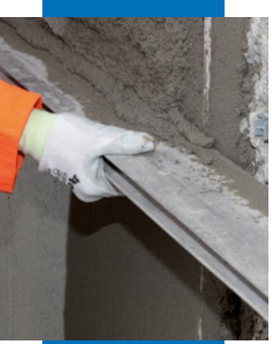
Levelling off Mapegrout 430 with a straight edge

and abrasion, in such cases use Mapegrout Thixotropic or Mapegrout T60 .