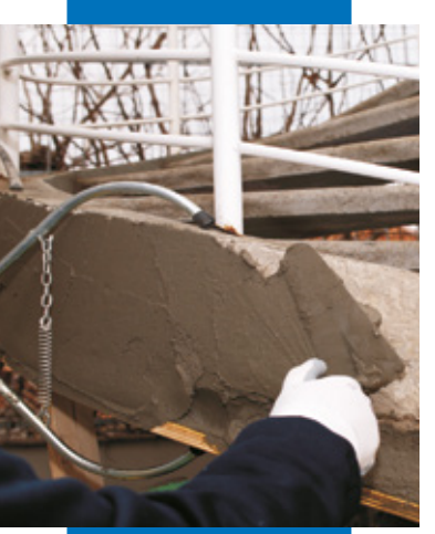
Application of Mapegrout 430 by trowel