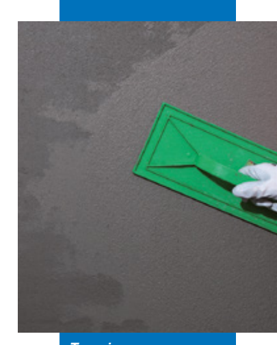
Tamping Mapegrout 430