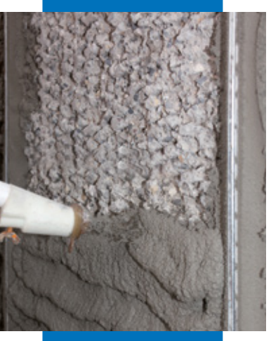
Application of Mapegrout 430 by spray