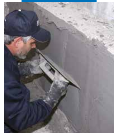
Application of Nivoplan with a float