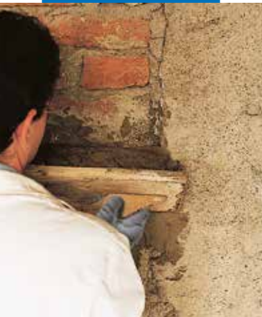
Restoring old brickwork