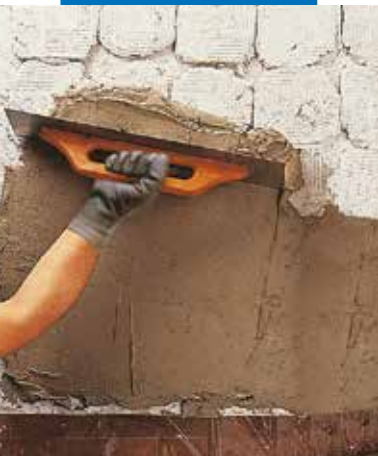
Levelling with a laying-on trowel