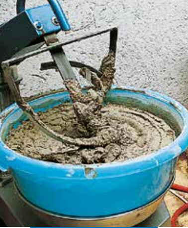
Mixing with a mini cement-mixer