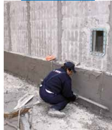
Levelling off the render with a straight-edge

All relevant references for the product are available upon request and from www.mapei.com