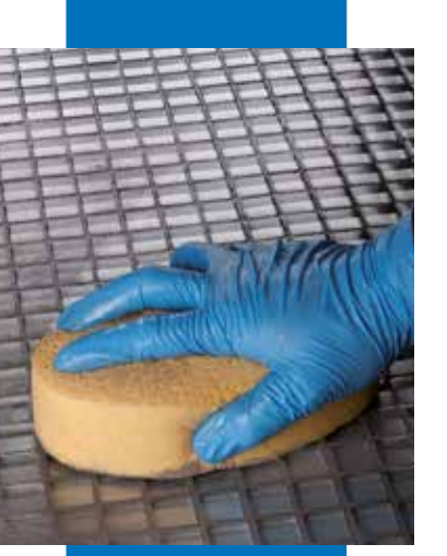
Final rinsing with a sponge