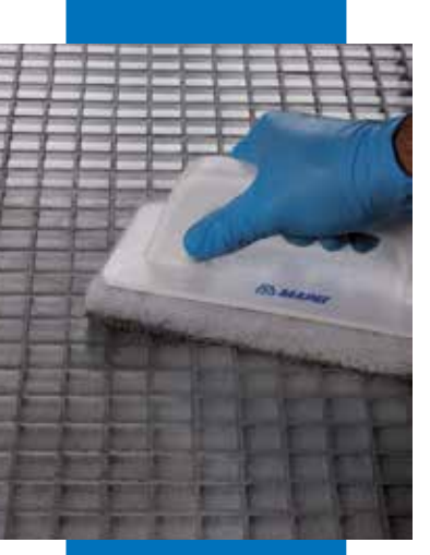
Cleaning with a Scotch-Brite® pad