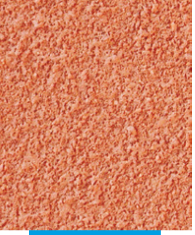
Close-up of the product in the above application -Figueras, Spain

conventional render and to old, well-bonded paintwork or coatings.