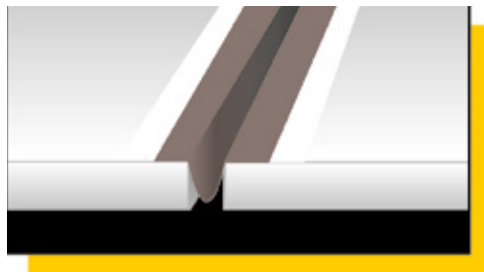
Positioning Mapeband PE 120 in an omega pattern in an expansion joint