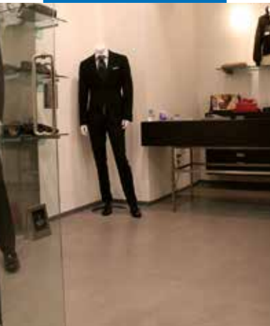
Floor made using Mapecolor Decor 700