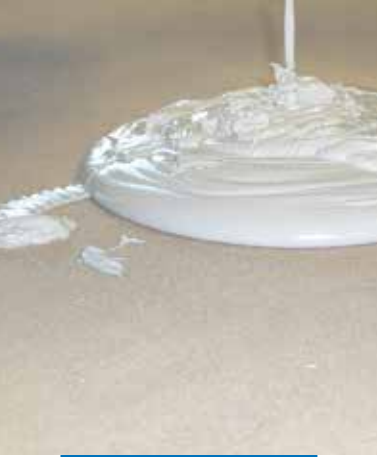
Mapefloor Decor 700 poured on the substrate immediately after mixing