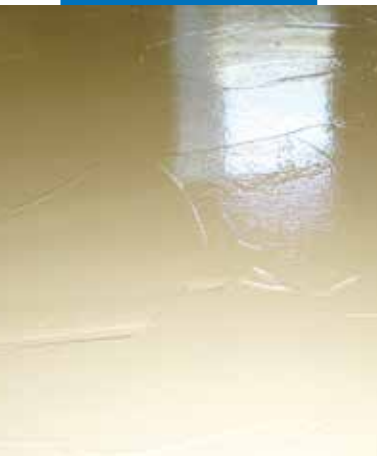
The fresh surface of Mapefloor Decor 700 after application with a trowel

Highly deteriorated joints must be repaired using the same products. If any of the above guidelines are not strictly adhered to, the quality of the final surface may be poor.