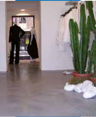
Floor made using Mapecolor Decor 700