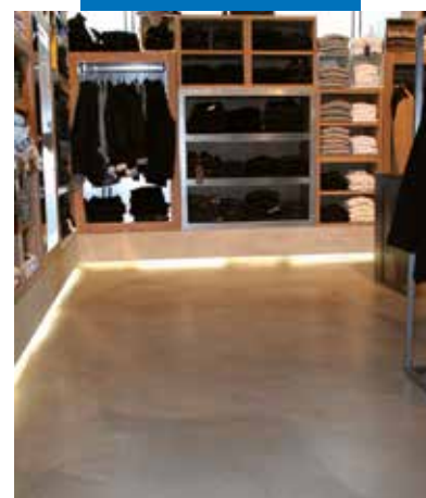
Floor made using Mapefloor Decor 700