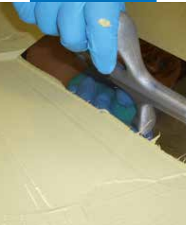
Application of Mapefloor Decor 700 using a smooth trowel