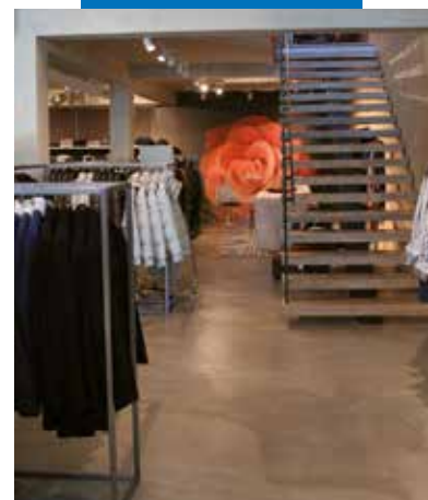
Floor made using Mapefloor Decor 700