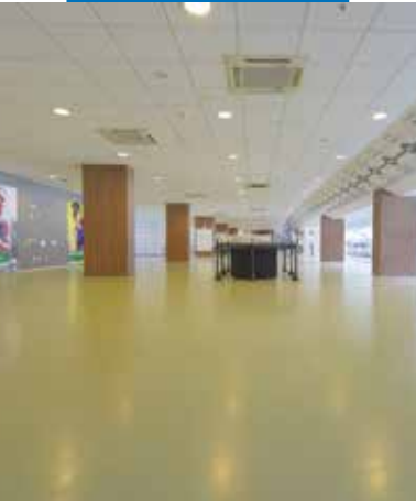
Stadium Fortaleza - Brasile