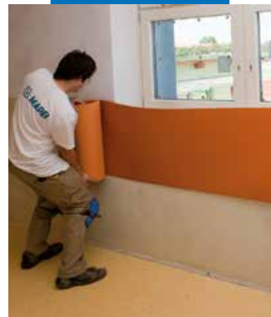
Application of rubber sheeting on a wall

All relevant references for the product are available upon request and from www.mapei.com