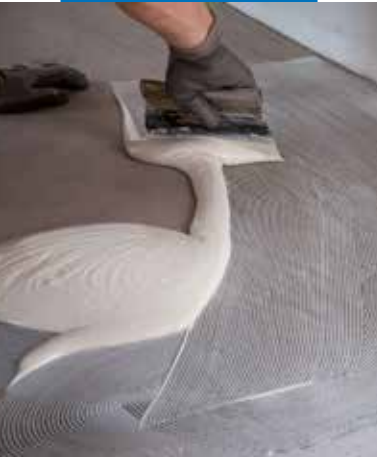
Application of Ultrabond Eco V4 SP Fiber on a substrate