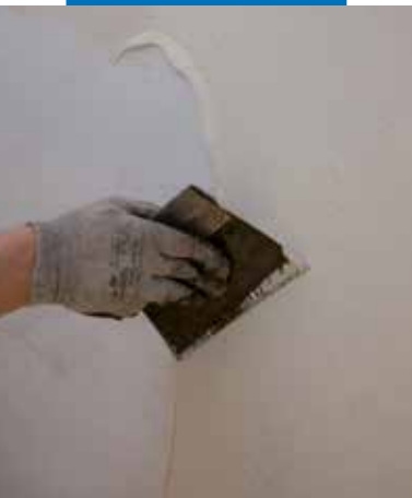
Application of Ultrabond Eco V4 SP Fiber on a wall