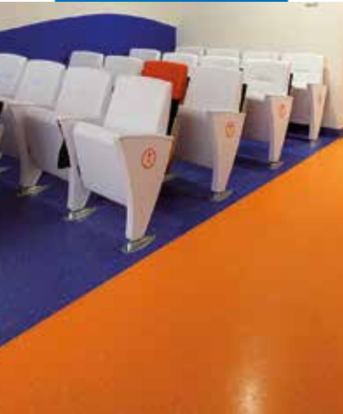
Fondazione Nemo Niguarda Hospital - Milan - Italy