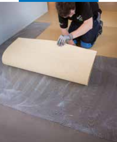
Installation of rubber tiles