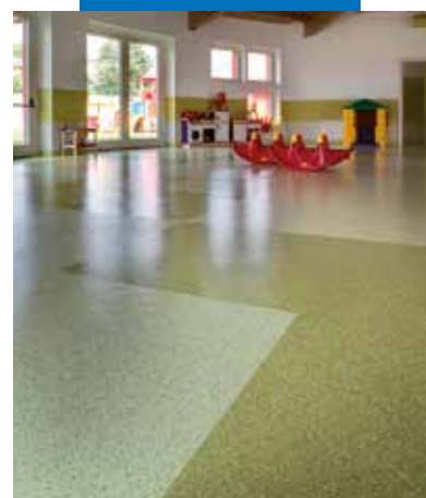
An example of installing rubber flooring in a school: Municipal Infants School, Carobbio degli Angeli (Bergamo)