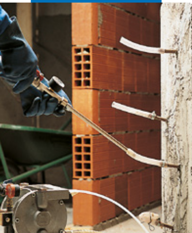
Injecting Epojet to a fissured pillar