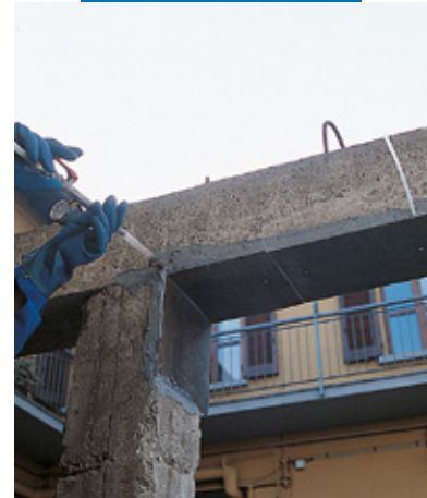
Repairing beam with injection of Epojet