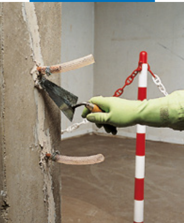
Fixing injection tubes with Adesilex PG1