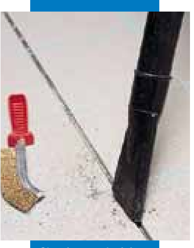
Cleaning out the joint with a vacume cleaner