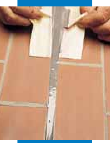
Expansion joint in red quarry tile floor sealed with Mapeflex PU21