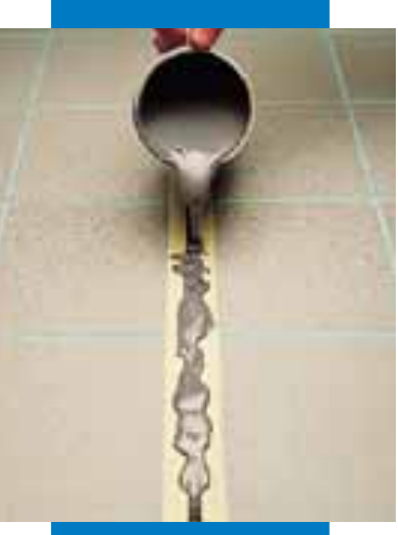
Filling the joint with Mapeflex PU21