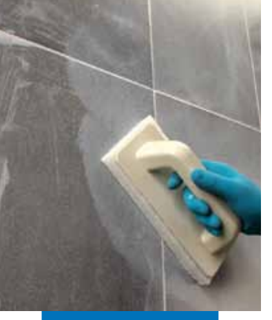
Cleaning the joints with a Scotch-Brite® pad