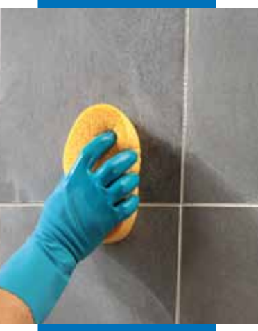
Finishing the surface with a hard, cellulose sponge