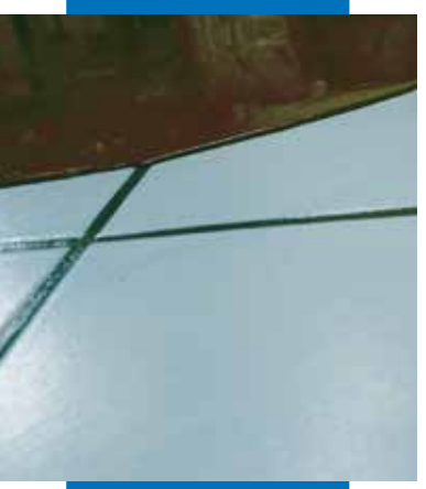
Detail of the application of Ultraplan on an existing ceramic tile floor after the application of Eco Prim T Plus