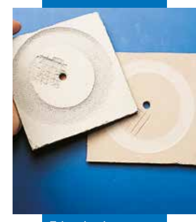
Taber abrasion executed on Ultraplan (right specimen) and on conventional levelling (left specimen) after 200 cycles