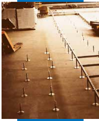
Slab levelled with Ultraplan ready for fixing a floating floor