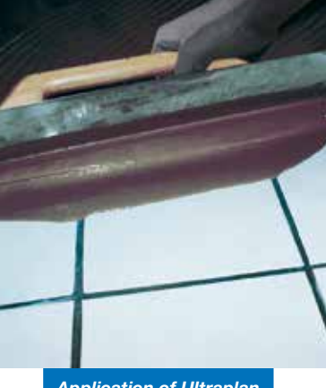
Application of Ultraplan with a metal trowel on an existing ceramic tile floor after the application of Eco Prim T Plus