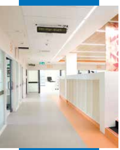
An example of an installation of linoleum on a surface levelled with Ultraplan - Victorian Comprehensive Cancer Centre - Melbourne - Australia

keeping in mind that the latter only gives indicative values.