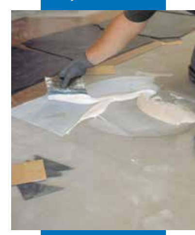
An example of an installation of inlayed PVC on a surface levelled with Ultraplan -CD 2 - Milan - Italy