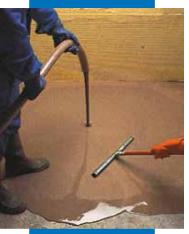
Application of Ultraplan with pump and squeegee