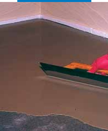
Applying Novoplan 21 with a metal trowel on a cementitious screed primed with Primer G