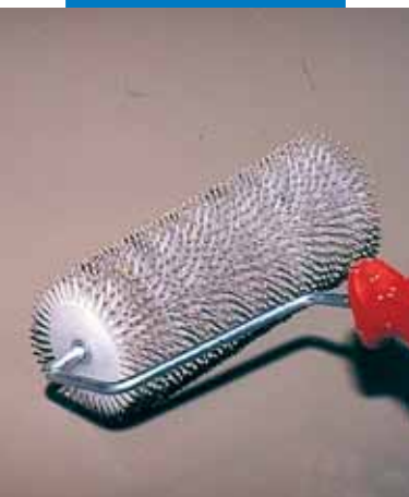
Using a spiked roller over a fresh coat of Novoplan 21