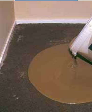
Applying the Novoplan 21 paste on the substrate