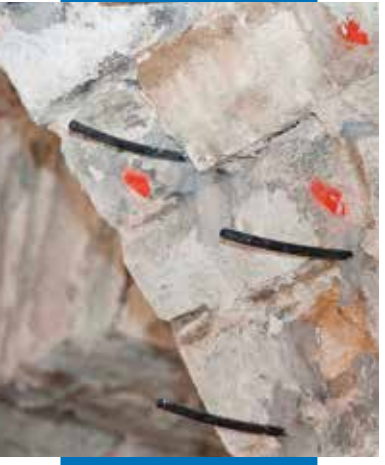
Detailed view of how the injection tubes are fastened in place