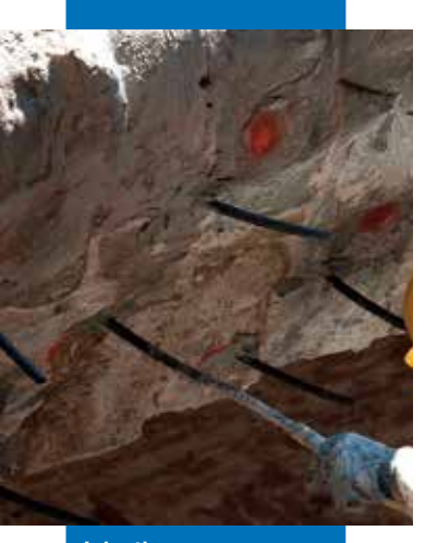
Injecting Mape-Antique F21 into a stone masonry