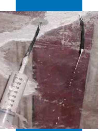
Injecting Mape-Antique F21 into a frescoed wall

render, including those with frescoes, was verified by the Istituto Centrale del Restauro (ICR, the Central Restoration Institute), now known as the Istituto Superiore per la Conservazione e il Restauro (ISCR, the Higher Conservation and Restoration Institute) during the consolidation operations on frescoes and the inner and outer faces of the domed roofs on the San Francesco of Assisi Cathedral.