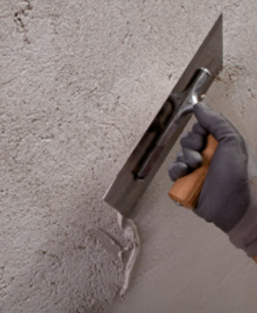
Application of Mape-Antique FC Civile