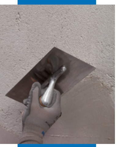
Application of Mape-Antique FC <u>Civile</u>