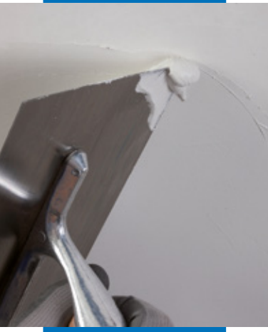
Smoothing over the product with a flat metal trowel

Part of application cycle for Mape-Antique FC Ultrafine