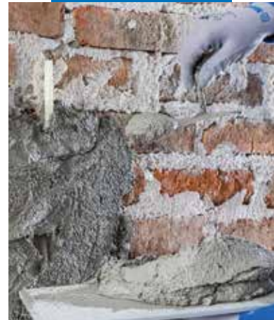
Application of the first layer of MapeWall Render & Strengthen