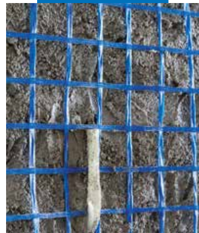
Mapenet EM placed in position