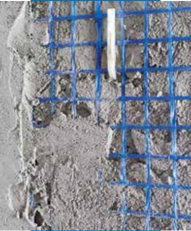
Application of the second layer of MapeWall Render & Strengthen