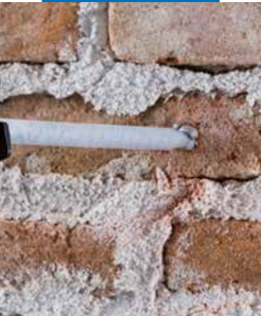
Application of the chemical anchor