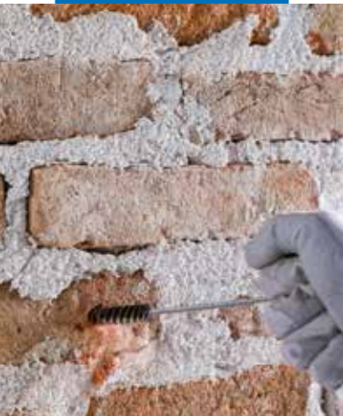
Removing dust from the holes