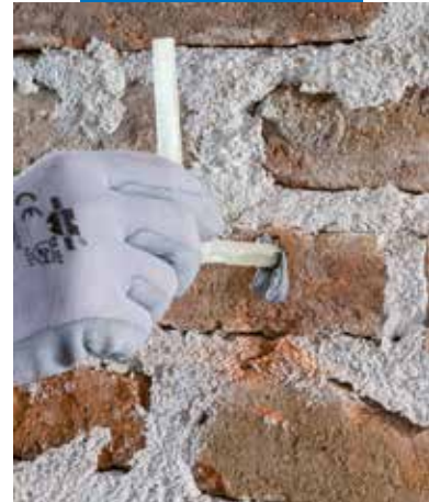
Inserting a MapeNet EM Connector

All relevant references for the product are available upon request and from www.mapei.com