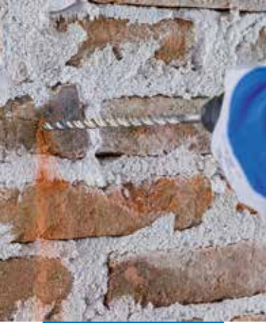
Drilling the holes