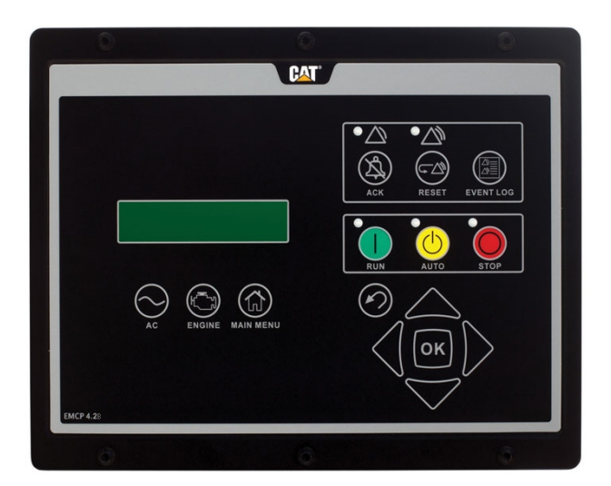
Pi cture shown may not reflect actual configuration