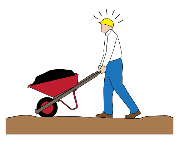
The wheelbarrow tire sinks into loose soil, requiring greater effort to push it through.

The wheelbarrow tire rolls easily on the smooth, stiff concrete.