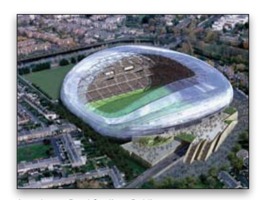
Lansdowne Road Stadium, Dublin - HOK and Buro Happold