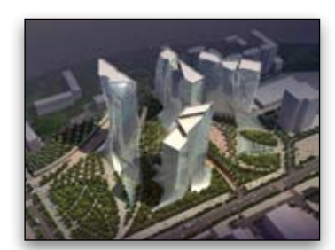
Dostyk Project, Almaty - NBBJ with E/YE Design