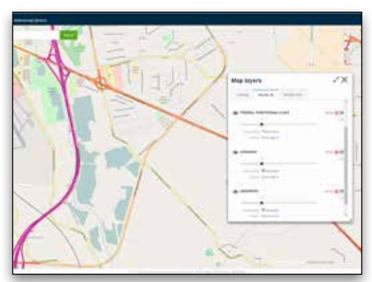
Visualize network located data from different sources.