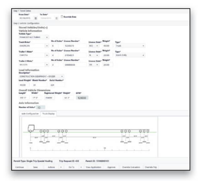
A step-by-step application process streamlines permit issuance.

SUPERLOAD provides distinct advantages to the permitting agency when linked with other systems or mined for detailed information. Agencies can choose to implement SUPERLOAD to work with Commercial Vehicle Information Systems and Networks (CVISN) and other agency programs to perform checks and can share data for roadside monitoring. Permit routing data provides detailed information on the movement of all carriers. The agency can query specific routing data such as vehicle dimensions and permit timeframes. Mined permitting data can help establish transportation improvement plans that alleviate highway system constraints that adversely impact effective movement of motor vehicles.