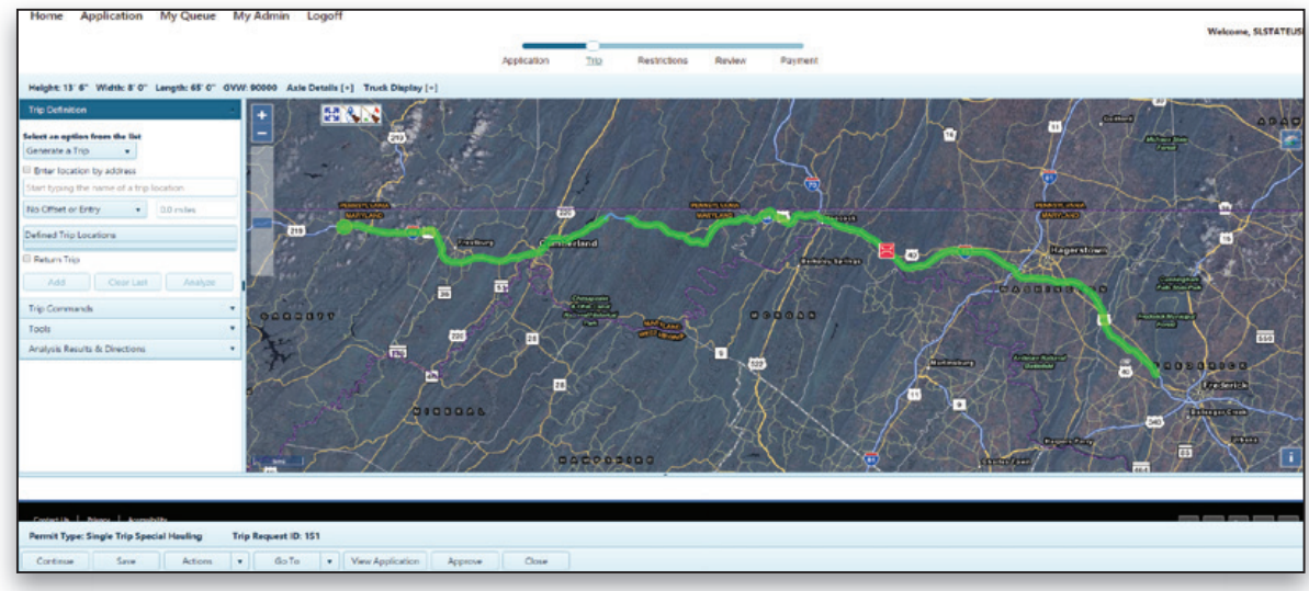
Underlay aerial photos and other WMS data provide for precise routing.

The SUPERLOAD system is designed to provide direct electronic communication with Bentley's GotPermits.com, a one-stop source for acquiring permits from multiple agencies. GotPermits.com is the growing choice of permitting points-of-issuance by transportation departments. Using GotPermits.com's advanced permit application process, transport professionals can complete a single permit application for permitting by several state systems. The website requests only the specific information needed by relevant states and provides multistate routing to resolve cross-boundary routing issues. This uniform processing not only simplifies data entry but also ensures conformance with all state laws, routing requirements, and processes.