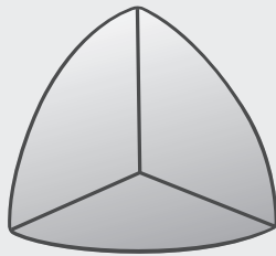
^ ART. 115.2

Supply and install ITALPROFILI® inside and outside corners or similar, made of UV stabilized TPO.